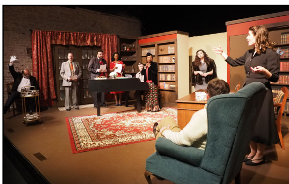
The Musical Comedy Murders of the 1940s